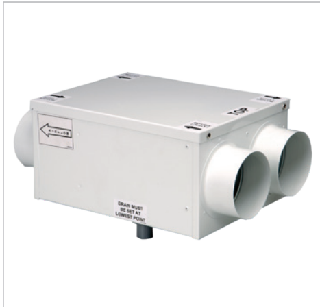
Image below shows MANHR100RS, please refer to F&W for flow direction and condensate location